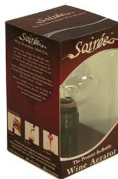
Soirée Classic Package MSRP: $24.99