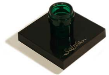
Soirée Stand & Drying Rack