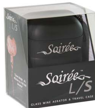
Soirée Luxury/Sport MSRP: $49.99